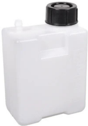
Container 600cc Oil KR-TAR12B